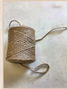
String or Twine