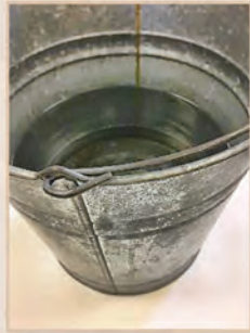
Bucket of Water