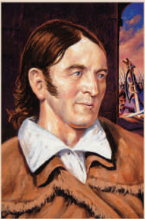
Legendary frontiersman from Tennessee