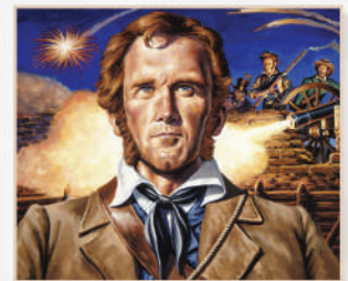
Commander of the Alamo